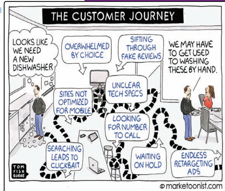
LET JGWD SOLUTIONS TAKE THE GUESS WORK OUT OF DECISION MAKING.

"We design, build, and market solutions that exceed expectations and produce results — solutions that you need"